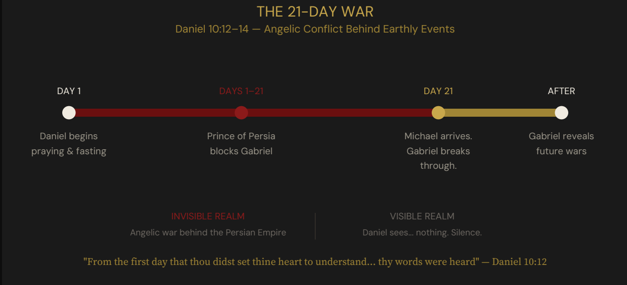
Fig. 5.4 — The 21-day angelic conflict of Daniel 10