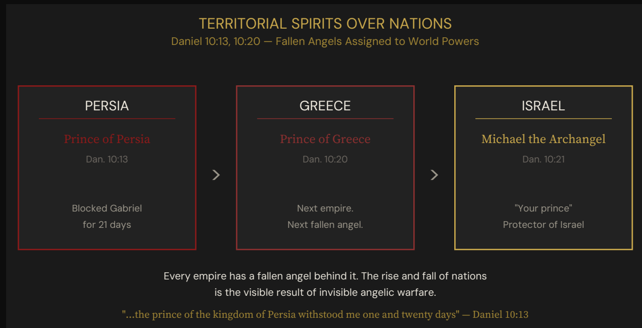
Fig. 5.1 — Territorial spirits assigned to world powers in Daniel 10

Gabriel tells Daniel about "the scripture of truth" in Daniel 10:21. There exists a written record in heaven of which nations will rise, which will fall, and when. Daniel got a glimpse of the war room. Most men never see past the news cycle.